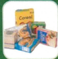
Cereal & Food Boxes Flattened