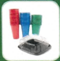
Plastic Food Trays and Cups