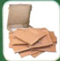
Cardboard & Pizza Boxes Flattened