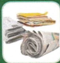
Junk Mail, Mixed Paper, Paper Bags & Newspaper