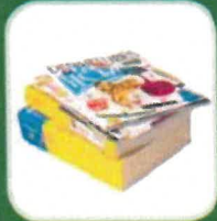
Magazines, Phone Books & Catalogs