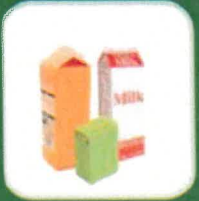
Milk & Juice Cartons & Juice Boxes