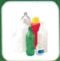
Plastic Bottles and Jugs