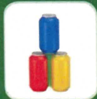
Aluminum Cans, Foil & Trays