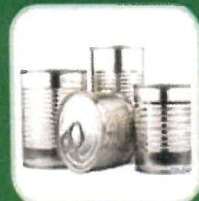
Metal Food Cans