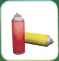
Empty Aerosol Cans Lids Removed