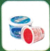
Wide-Mouth Plastic Containers #1-#7